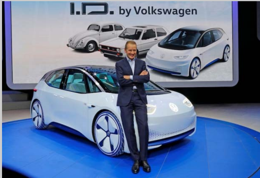
I.D by Volkswagen

introduced the brand I.D. by Volkswagen that will feature a new range of EVs capable of going 250-375 mile . They will be available in 2020. The company also announced 30 new electric vehicle models by 2025.