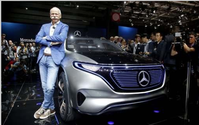
Dieter Zetsche, CEO of Mercedes Benz with the New Generation EQ

Mercedes-Benz introduced the new Generation EQ line of EVs which will be available for sale in 2018.