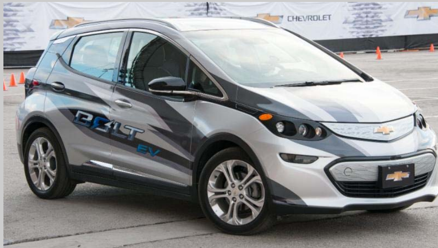
2017 Chevy Bolt

Chevrolet is rolling out the production of the Chevy Bolt with 240 mile range. It will be available at $37,495 this December. The Bolt is the first mass produced vehicle with a range comparable to the Tesla S and a price comparable to the Tesla 3. It will have a one year advantage over the Tesla 3 to gain market share and position itself as a No-Range-Anxiety EV.